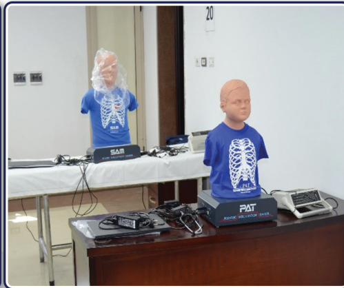
Manchester program building